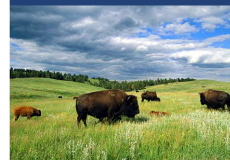
Wildlife enhances the pristine Black Hills