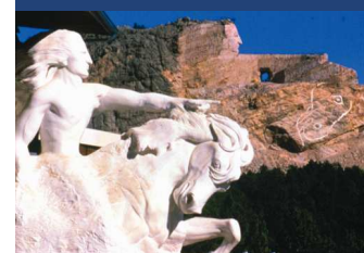
Crazy Horse Monument to be 10x the size of Mt. Rushmore