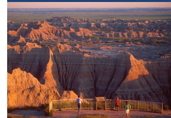
Spectacular Badlands National Park